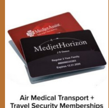
Travel Security Memberships Take Trips. Not Chances.

You can buy peace of mind with a Medjet Membership. Medjet is a premier global air medical transport and travel security membership program for travelers. One in <u>30 trips</u> end in a medical emergency, and safety while traveling has become a growing concern. Insurance gets you to the "nearest acceptable facility". Medjet membership can get you home. <u>https://link.where2nexttravel.co/2lg</u>.